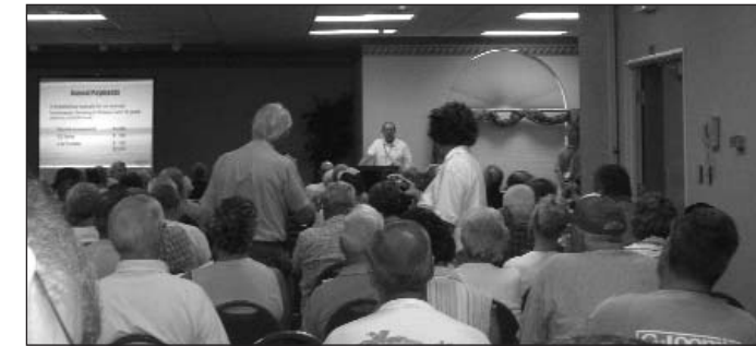
Approximately 215 people attended the public meeting on August 5, 2006, in Lexington.

At the second public meeting, the Johnson Lake Engineering Team (JLET) updated meeting attendees with the project's progress and shared financial projections. An overview of the information presented at the meeting is included in this handout, along with answers to questions asked at the meeting.