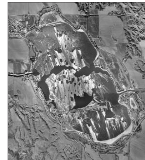
Aerial view of Johnson Lake, Dec. 2003